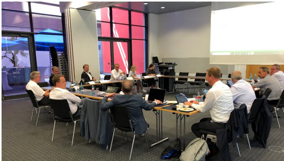
Experts discussed the submitted innovations when the panel met.

The independent panel has now selected the best products and assigned them to three award classes: 'Nominee' for innovative products and solutions, 'Finalist' for outstanding technological innovations, and 'Winner' for the top product in each category. The panel ended up selecting 96 'Nominees' and 35 'Finalists'. The companies chosen as the winners of the coveted Innovation Awards will not be announced until the awards ceremony at Automechanika, which is taking place on 13 September at 5:00 p.m. in "Harmonie" hall in the Congress Center.